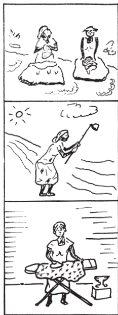
Dis Ah Hard Wuk/WICA Project, St. Vincent and the Grenadines

also use NGO information, in combination with government responses to its questions, when preparing its concluding comments. In addition to reading the shadow reports, the Committee has adopted the practice of holding informal meetings during its sessions in order to hear country-specific information directly from NGOs.