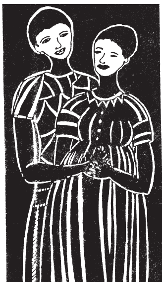
Sauti ya Siti

Provisions for maternity protection and child care are proclaimed as essential rights. They are found in all areas of the Convention, whether dealing with employment, marriage and family relations, health care or education.