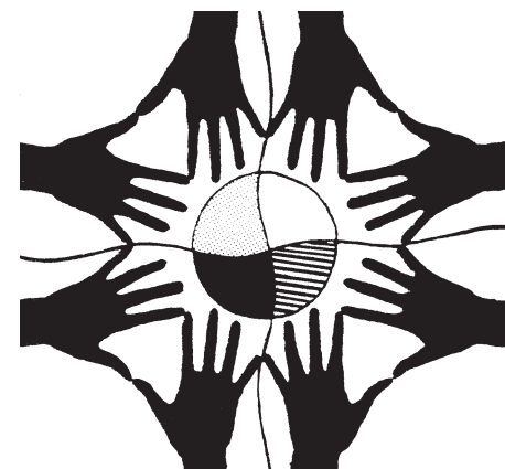
Sigrid Blohm/Voices Rising

NGOs can use the concluding comments as a lobbying tool to encourage governments to take action along the lines recommended by the Committee and institute positive legal and policy reform at the national level. Many Caribbean countries have embarked on a process of constitutional reform, in part because most of the independence constitutions were created with little or no input from the people of the countries concerned. This offers an important opportunity for lobbying for stronger protection of women's human rights (see Box 7 in section 6).