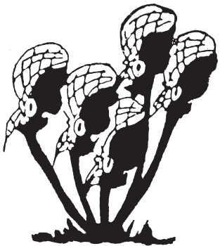
Sojourner Sisters Inc.