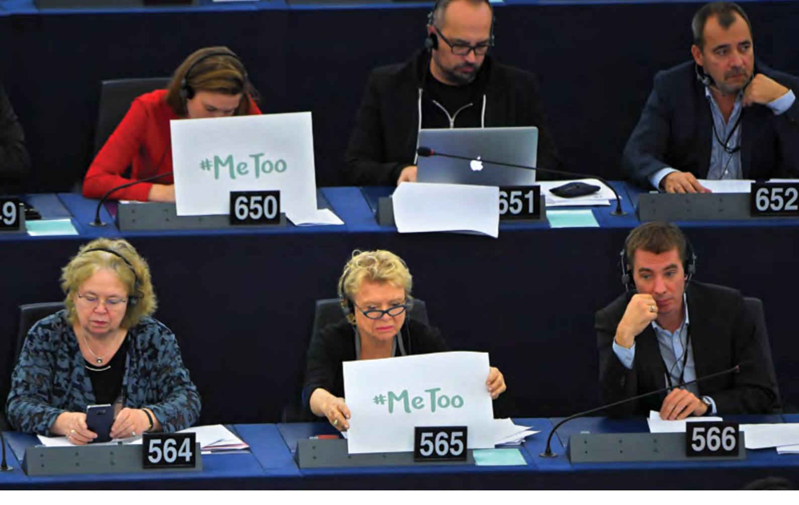
European Parliament, 2017

While Angela Merkel retained her position as Chancellor of the Federal Republic of Germany for a fourth term, she now works with a Bundestag (lower house) with noticeably fewer women. Overall, the proportion of women elected to the legislature in 2017 fell by 5.7 percentage points to 30.7 per cent, the lowest level in almost 20 years. Those parties that returned the highest number of women were those that have adopted voluntary gender quotas: the Social Democratic Party, the Left, and the Greens (41.8 %, 53.6%, and 60.9% of successful women candidates, respectively). Fewer than 20 per cent of the seats occupied by Merkel's Christian Democratic Union/Christian Socialist Union party, which has no gender quota, are held by women, the second lowest of the six parties now represented in the Bundestag. Likewise, the newest arrival on the parliamentary scene - the Alternative for Germany (AfD) party - and the Free Democrats (FDP) - have no gender quotas; women make up only 10.9 per cent and 23.8 per cent of their MPs, respectively.