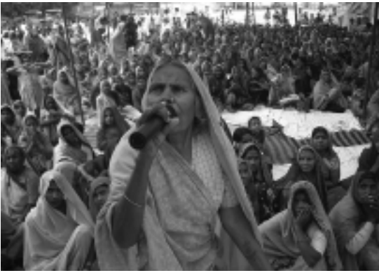
Community leaders putting forward their demands to local and national government representatives, PRIA, India

Critical acts, including the discussion of ‘women’s issues’ in parliament and the promotion of gender-sensitive policy, may be enabled by a range of factors, including representatives’ links with women’s and feminist groups and movements, support from relevant civil society organisations, the wider ideologies of dominant political parties, and international advocacy with respect to particular issues. Safe spaces for gender-sensitive advocacy and action may be formed within formal political structures when women representatives with shared political perspectives attain minority status within a particular party. They may also be created through the development of alliances between women working in different political parties or among women active in formal and informal politics, as will be discussed further below.