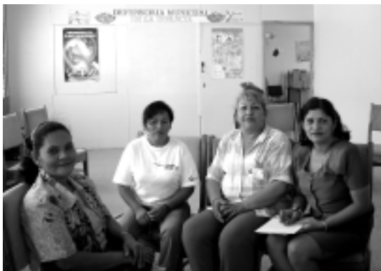
Local government members and representatives of CEM-H in the Municipal Women's Office in Nacaome, Honduras

Alliances between progressive women and men in formal and informal politics (including women who are part of women's and feminist movements) have also proved productive in this regard. For instance, through linking women in formal and informal politics, the Tanzania Gender Networking Programme has effected significant changes in laws around civil liberties, sexual violence, and land rights in the country.