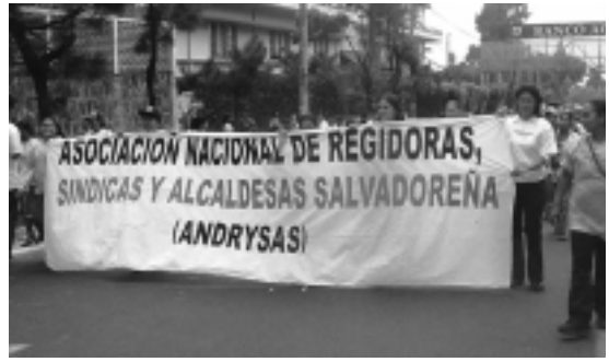
National Association of Women Councillors and Mayors of El Salvador (ANDRYASAS), demanding more political space for women

In contexts where governmental corruption is rife, efforts to democratise and hold political parties accountable to the promises they have made may not be enough. Corruption allows crucial decision-making processes to be taken out of the public domain and therefore reduces the opportunities for women and civil society to influence them. Specific and urgent attention must be focused on exposing and addressing deep-seated problems with corruption at a number of levels. Where political parties have created disenchantment and corruption, women's organisations can emerge to play an even more significant role.