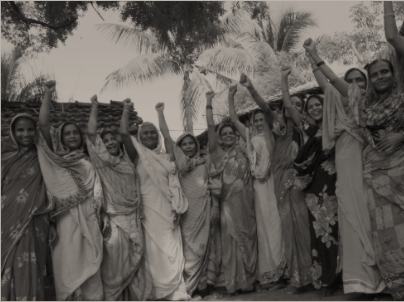
Grassroots women's association members in Murshidabad, India