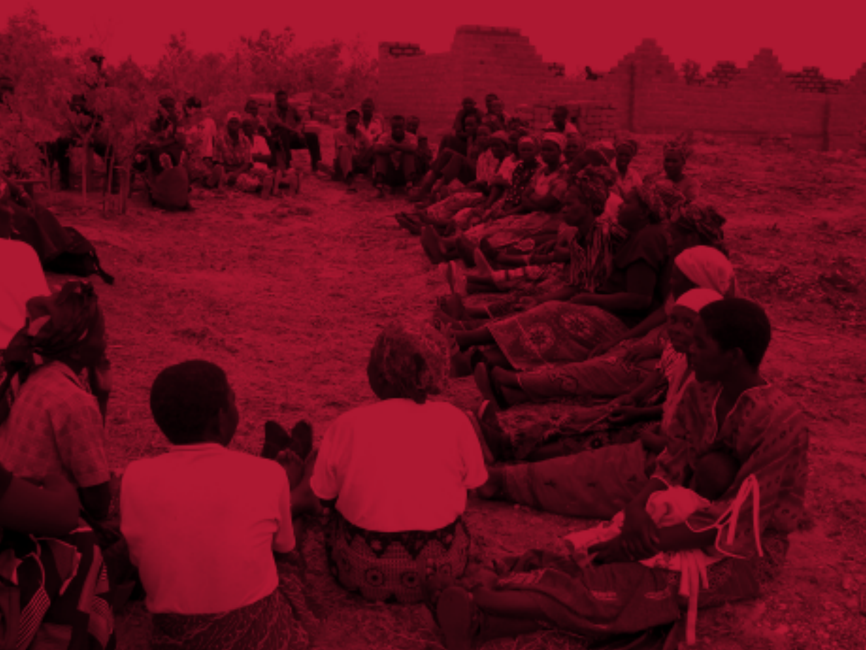
Community women's organisation members and representatives from Women for Change, discussing the success of their woman candidate in the local election, Madzubuka, Zambia