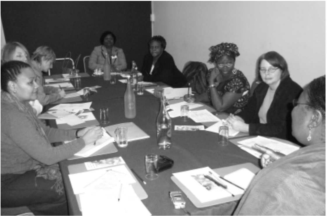
Participants of the Just Politics Dialogue during the discussion days in London

One World Action's Just Politics Programme is part of our Programme Partnership Agreement with the Department for International Development, UK