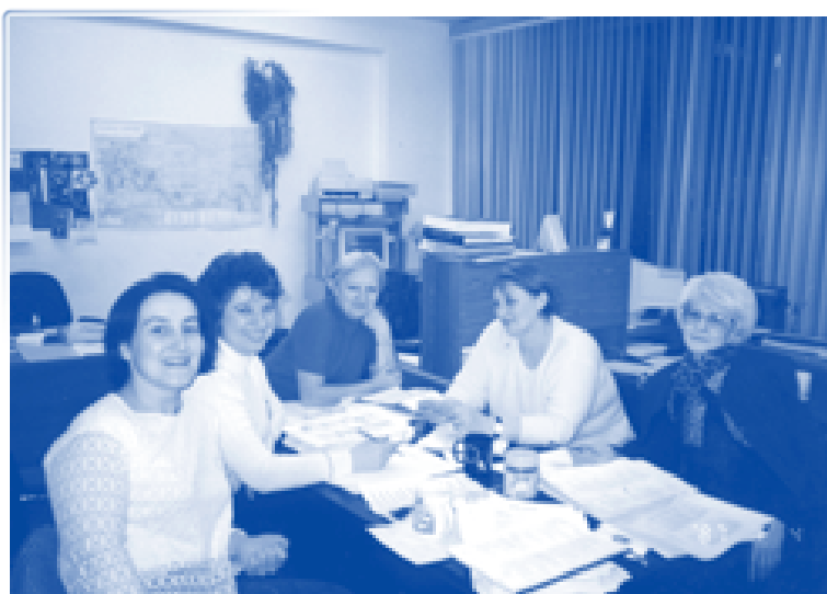
Members of MCGS review findings from their gender analysis of Russian legislation

Through its research and extensive, often groundbreaking documentation, MCGS promoted public awareness about gender-related issues and trends. Roundtables and workshops on each of the four theme areas were organized, and both print and broadcast media were used for wide dissemination. This included journal, magazine, and newspaper articles, and appearances of the research team on news programs and talk shows. MCGS also used the Internet to disseminate findings and participate in conferences. In addition, the MCGS project directly and indirectly contributed to the drafting and