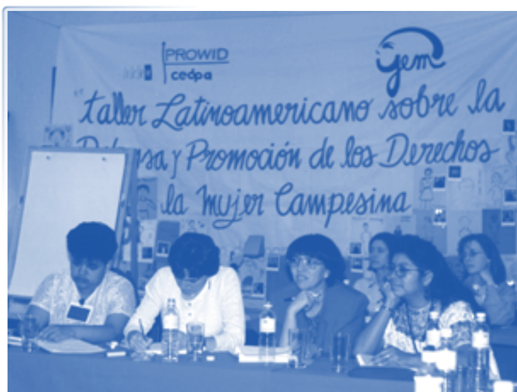
PROWID project partners participate in a regional workshop on advocacy and the promotion of rural women’s rights in Latin America hosted by GEM

GEM’s project activities raised the visibility of women’s work and the value of their contributions to the Mexican economy and society. This was possible because GEM acknowledged the importance of exploring its own strengths and weaknesses, a process that “professionalized” its performance, elevated its image, and made its work better suit the needs of its constituencies.