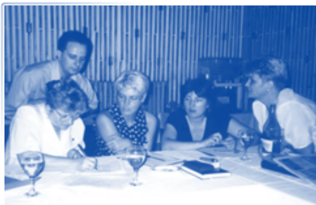
Participants in a regional consultative meeting in Drobeta Turnu-Severin, Romania

at least comparable to those of male colleagues. Those fortunate enough to hold jobs often cope with unfavorable work conditions such as