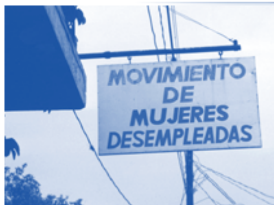
Cenzontle’s ongoing work in the areas of credit, technical support, and training helped generate jobs for unemployed Nicaraguan women

to strengthen their self-confidence, skills, and organizational abilities. In one indication of the change that resulted, the women who participated in the Cenzontle project were at the forefront of community recovery efforts following Hurricane Mitch in October 1998.