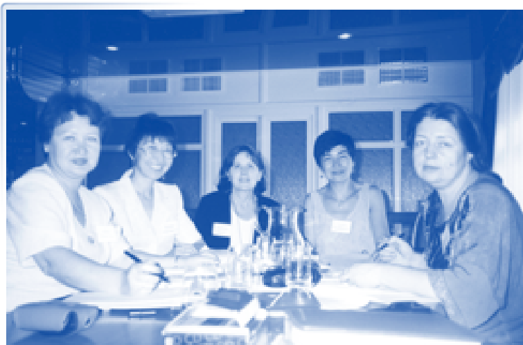
Project participants meet at an advanced human rights training for NGO leaders in Kiev, Ukraine

vulnerable to human rights violations and in possession of few skills or opportunities for redress. Growing unemployment and wage cutbacks, as well as the dismantling of social services such as day care, have hit women the hardest because of their unequal and often insecure place in the labor market. Other worrisome trends include a rise in domestic violence and a loss of trust in law enforcement agencies, with a consequent decline in the reporting of rape and other violent crimes.