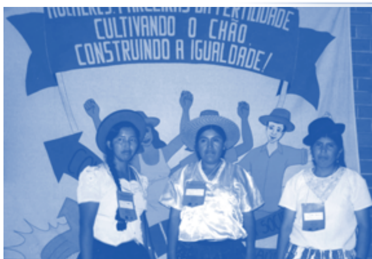
Bolivian women of the Via Campesina movement gather at a Latin American assembly in Brazil

The workshops and follow-up exchanges resulted in advocacy initiatives, including proposals to modify laws related to women farmers and land reform. Groups met with government officials in their countries on a range of issues, including access to credit and