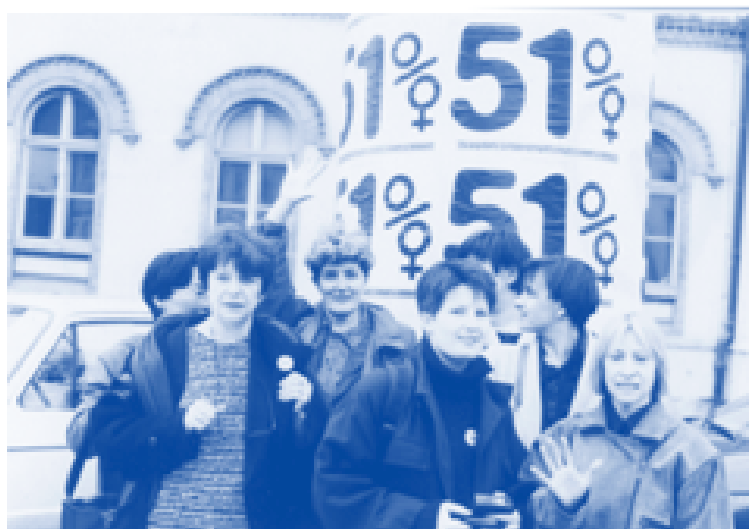
B.a.B.e. and Ad Hoc Coalition members spread their election campaign messages throughout Zagreb, Croatia

In collaboration with its Croatian NGO network, B.a.B.e. prepared the NGO Report on the Status of Women in the Republic of Croatia , which it presented at the January 1998 session of the Committee on the Elimination of all Forms of Discrimination against Women (the CEDAW