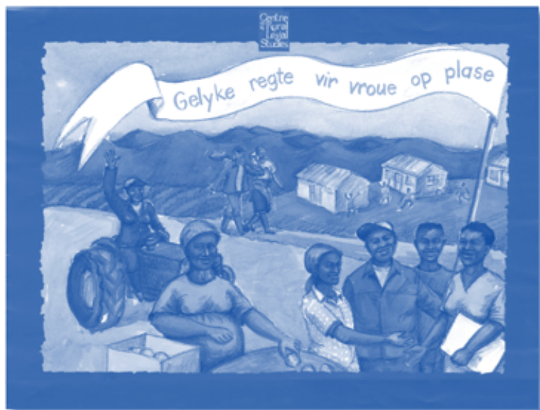
Materials produced by the Centre for Rural Legal Studies to promote equal rights for women on farms in South Africa

Throughout the project, the Centre collaborated closely with the CGE. As a result, the Centre was invited to host workshops for the Western Cape CGE and the Departments of Agriculture, Labor and Land Affairs, to raise awareness of CEDAW and to work with public servants to develop gender-sensitive indicators of achievement. The CGE has now pledged to conduct research on pay equity in agriculture, used the research to evaluate South Africa's compliance with CEDAW, and collaborated in developing a set of indicators to track achievement in formulating gender-sensitive policy with regard to the status of rural women. These indicators include incorporating a focus on rural women in program and budget preparation; prioritizing research on women living or working on farms; complying with anti-discrimination provisions under CEDAW; and making available education, training, and services in support of women's rights.