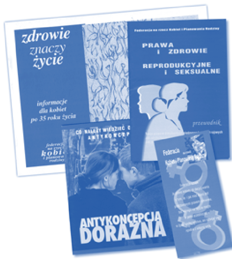
Public education pamphlets on women’s sexual and reproductive health prepared by the Federation

One of the main goals of the project was to equip women with skills and knowledge needed to create change through democratic processes. This was accomplished primarily through the production and dissemination of written materi-