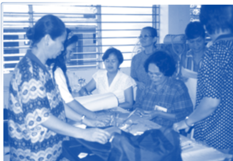
Women develop strategic campaign messages as part of the electoral training supported by CLD

CLD carried out its advocacy project in two phases: training and planning. Training involved a series of seminars on topics such as political awareness, gender analysis, legislative advocacy, developing legislative proposals, the electoral process, and campaign organizing. Soon after training took place, project organizers recognized the need for an entity that could serve as a focal point for collaboration. This led to the establishment of a 200-member, province-wide