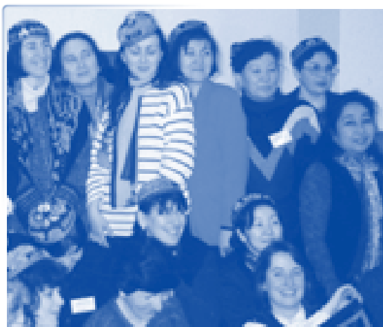
Women's rights activists from the Central Asian Republics participate in a WLDI training session

efforts on domestic violence as a human rights violation, conducting a series of workshops at schools and factories and with local NGOs to create a base of advocates in favor of amending relevant laws. Many project participants found that constituency building through awareness-raising and educational initiatives not only built sustainable citizen participation, but was also viewed by governments as nonthreatening.