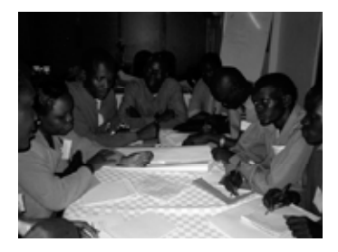
Participants in the March 5-7, 2004, youth workshop in Kampala, Uganda, develop action plans to increase youth involvement in Sudan.

In the workshop, the youth also began to look at the broader context of governance and their agenda for Southern Sudan as the country begins the first steps toward democratic rule. The youth developed an extensive list of resolutions and recommendations for the SPLM, civil society and donors as all begin to consider important issues like a Southern Sudan constitution, governmental structures and development priorities. A few of these recommendations are highlighted in summary form below.