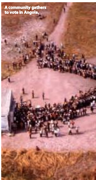
A community gathers to vote in Angola.

Gains in the number of women in office have rarely been achieved without pressure and support from women’s organizations, advocacy, lobbying, training of women candidates, alliance-building, external financial assistance and, increasingly, the use of quotas. At the global level, more than half the countries that held elections in 2003 used some form of affirmative action to increase women’s representation, and the experience of the 14 countries that have crossed the 30 percent threshold of women parliamentarians set by the Beijing Platform for Action shows that gender quotas and reservations are the most effective policy tools for increasing the number of women in office.