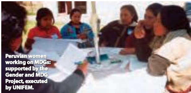
Peruvian women working on MDGs: supported by the Gender and MDG Project, executed by UNIFEM.

Enhancing women's freedom and equality must be a deliberate and consistent part of all that we do. Expanded freedoms for all, women and men, girls and boys, must be our goal – both because it is necessary for development effectiveness and because equality is a core value of the UN Charter, a value we have all pledged to protect as representatives of the UN system.