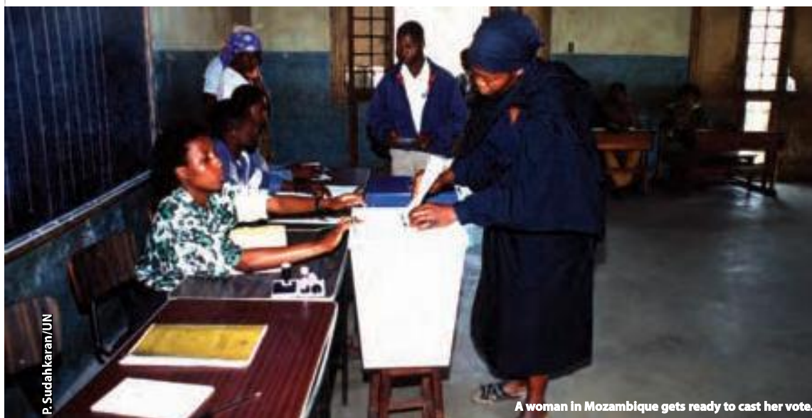
A woman in Mozambique gets ready to cast her vote.